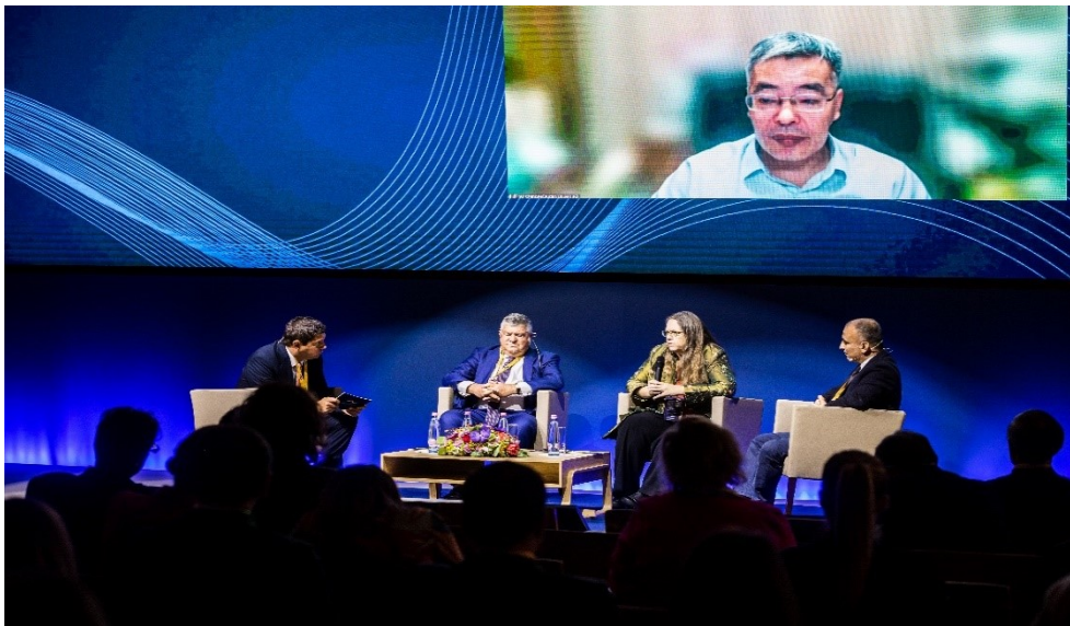
PANEL 2. GEOPOLITICS: Globalisation Vs. Regionalisation? The changing value chains, connectivity and prosperity of Eurasia