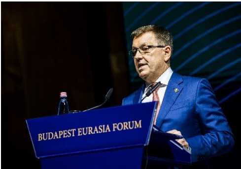
György H MATOLCSY, Governor Magyar Nemzeti Bank (MNB)

This year's Forum was opened with a welcome address by the Governor of the MNB György Matolcsy , who said that nowadays everyone is looking for the secret recipe for sustainable growth and competitiveness, and he claimed that the key to this mystery lies in the method for achieving results, namely cooperation. He argued that it was particularly important to engage in international dialogue and hold forums such as this annual conference series organised by the MNB. In connection with today's challenges, the governor of the MNB considers it important to learn from the lessons of past economic events, and develop new patterns and rules to stay on a path of sustainable growth.