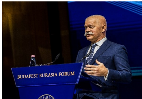
János CSÁK, Minister of Culture and Innovation, Hungary