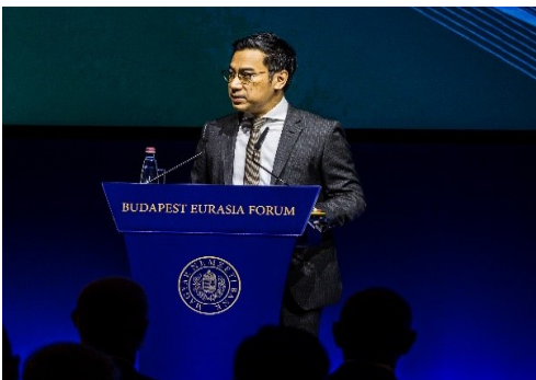
Sethaput SUTHIWARTNARUEPUT, Governor Bank of Thailand