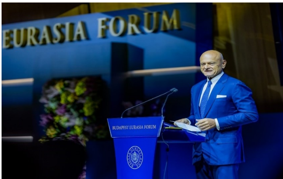
Closing remarks from Mihály PATAI, Deputy Governor, Magyar Nemzeti Bank (MNB)

The prestigious event showcasing a wide range of international experts and scientists ended with the thoughts of Deputy Governor of the MNB Mihály Patai , who pointed out that this year's event once again showed the importance of stepping up international cooperation in all areas, whether in finance, the economy or education. The Eurasian nations are bound together by their shared cultural heritage, which serves as the foundation for deepening cooperation in the future.