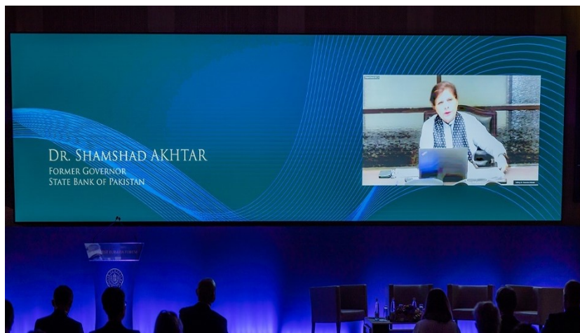
Shamshad Akhtar, Former Governor, State Bank of Pakistan Former Care Taker Finance Minister of Pakistan

The fifth panel discussion of the Eurasia Forum revolved around multilateral cooperation, and it was called “ Regional and megaregional integrations: How can international cooperation serve competitiveness of the supercontinent? ” The keynote speech was given by Shamshad Akhtar , former Governor of the State Bank of Pakistan. In his speech, Dr Akhtar stressed that the growing interdependence between Europe and Asia could facilitate the reform of the regional multilateral framework, along with global growth, stability and regional economic welfare. He claimed that the integration of the Eurasian supercontinent can be enhanced by deepening financial integration and improving regional value chains and technological and digital ties.