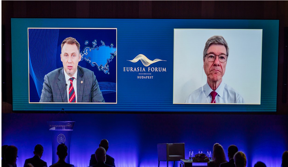
Barnabás VIRÁG, Deputy Governor Magyar Nemzeti Bank (MNB)