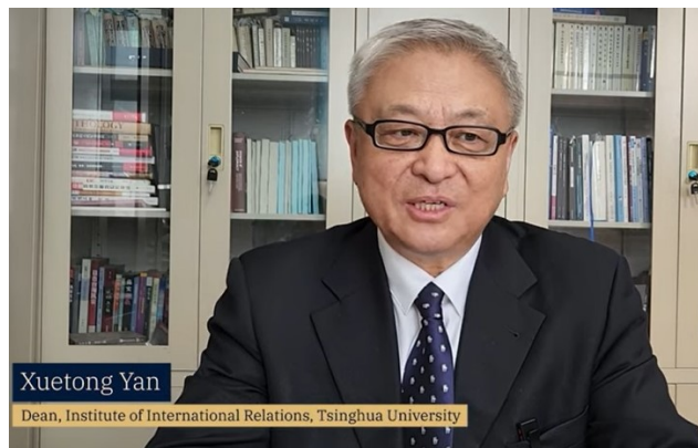
Xuetong Yan Dean, Institute of International Relations, Tsinghua University

The second panel of the Eurasia Forum was called “ Globalisation vs. regionalisation? The changing value chains, connectivity and prosperity of Eurasia ”. This year's geopolitical panel mainly examined the impact of geopolitical changes on supply chains, along with the role of megacities in these processes. Before the panel discussion, Yan Xuetong , the world-famous dean and expert of the Institute of International Relations at Tsinghua University, provided food for thought in his video address on anti-globalisation trends as well as weakening regional cooperation, in particular the “Belt and Road” initiative. Professor Yan underlined that populist trends do not point towards international cooperation, and when coupled with power, they exert an anti-globalisation impact. He added that efficient regional cooperation today requires appropriate leadership, and that globalisation can only be revived in the future with close cooperation.