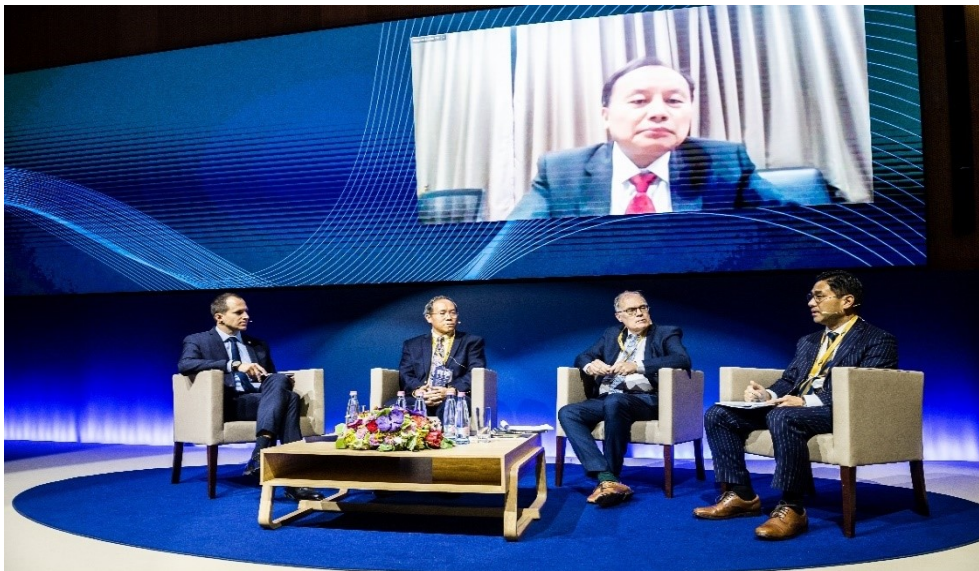
Panel 3. – INFRASTRUCTURE, CONNECTIVITY AND TECHNOLOGY: Logistics, infrastructure and technological developments in the service of a competitive and circular economy