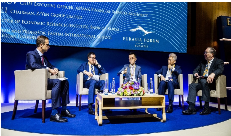
PANEL 1. FINANCE: Ingredients of success in the financial sector: How to strengthen new financial hubs in Eurasia?