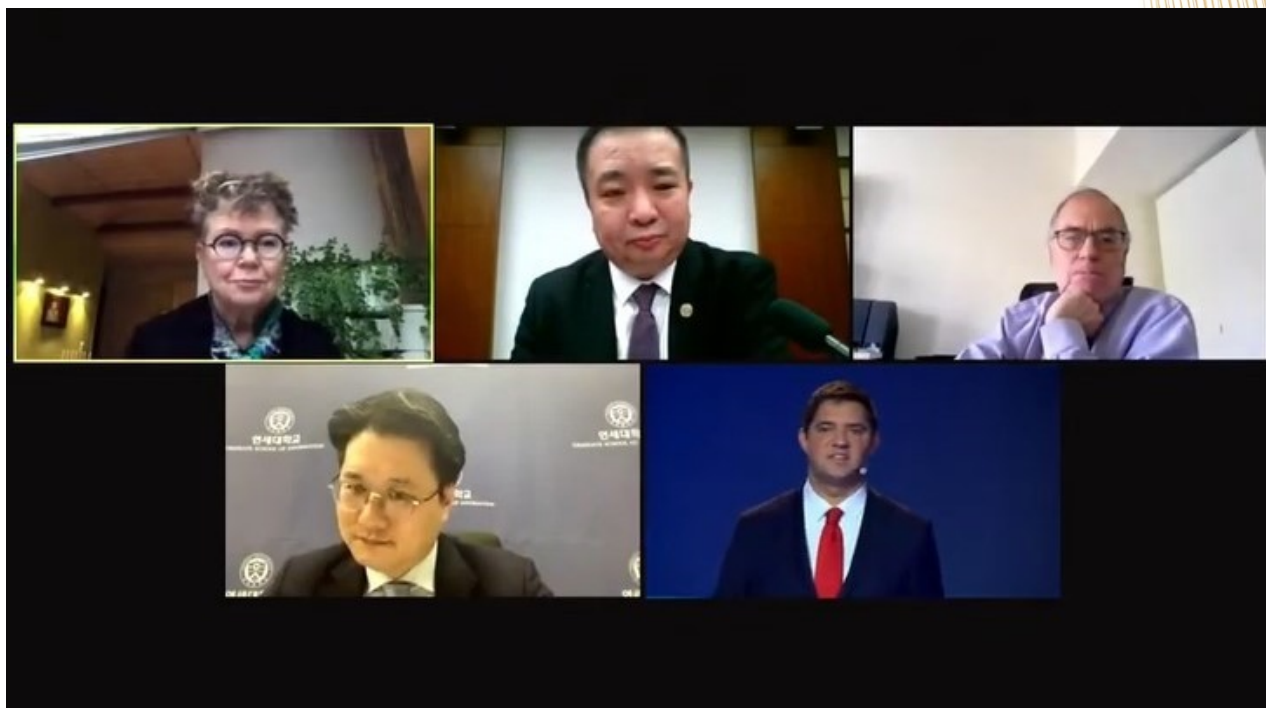
PANEL 3: Smart cities for a healthy future? Innovation in Urbanisation and the Importance of Digital Literacy