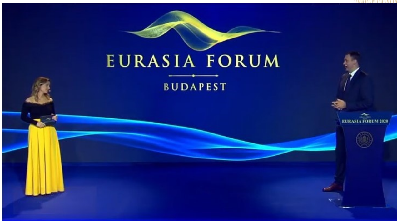
Barnabás Virág, Deputy Governor of MNB is opening the second panel

The keynote speech of Kyuil Chung , Deputy Governor of the Bank of Korea, was built on precisely these two main topics, green growth and enhancing digitalisation. To overcome the profound economic impacts of the pandemic and to support the economic reforms of the South Korean