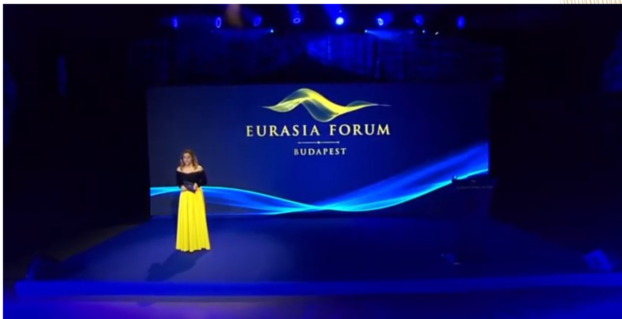
The live studio of the E-Conference

In light of the pandemic, the event took place on 27 October this year under the title of “ Eurasian Cooperation in the Post-Pandemic Era ”. In line with the basic concept, the event's professional programme went far beyond the central bank and monetary policy issues in the classical sense, as achieving long-term sustainable economic growth requires interdisciplinary dialogue that includes issues of innovation, technology, geopolitics and education as well.