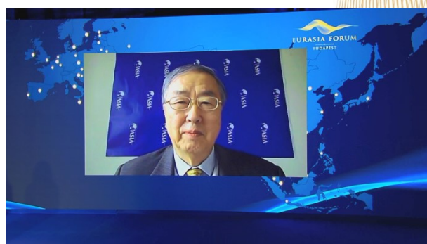
Xiaochuan Zhou, Vice Chairman of the Boao Forum for Asia, former Governor of PBOC