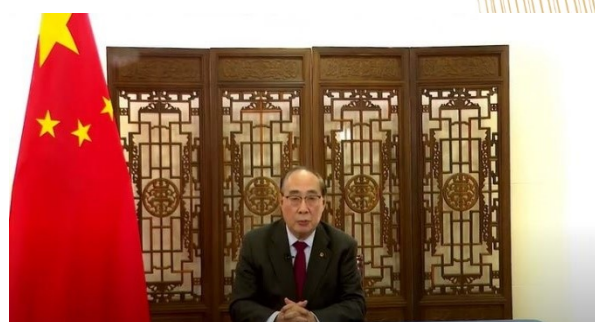
Hongbo Wu, Special Representative of the Chinese Government on European Affairs, former UN Under-Secretary-General for Economic and Social Affairs